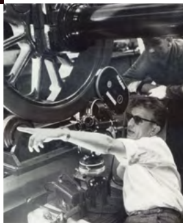
Filming at Krupp, 1959